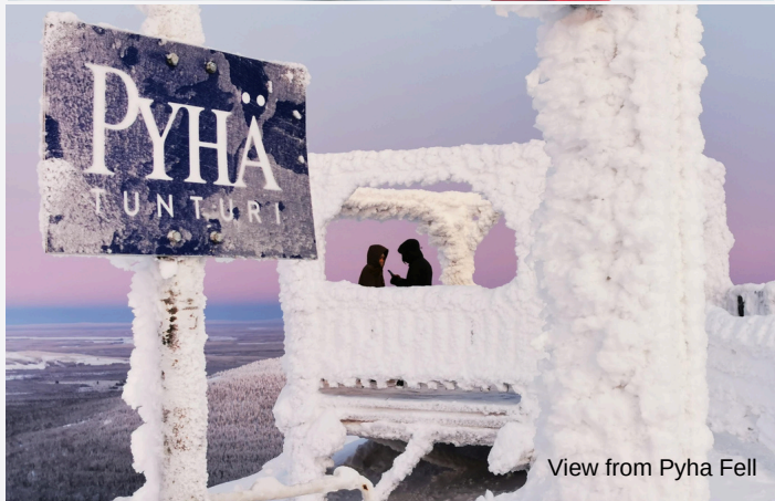
View from Pyhä Fell