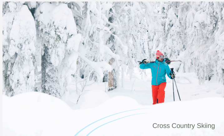
Cross Country Skiing