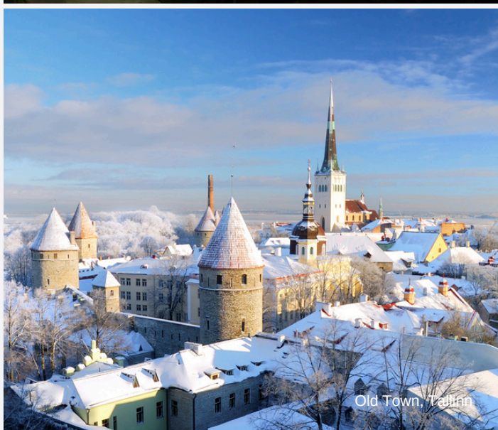
Old Town Tallinn