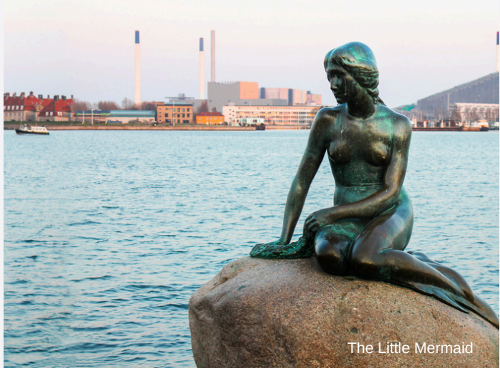
The Little Mermaid

This afternoon, set off with your guide on a walking tour of the old city.