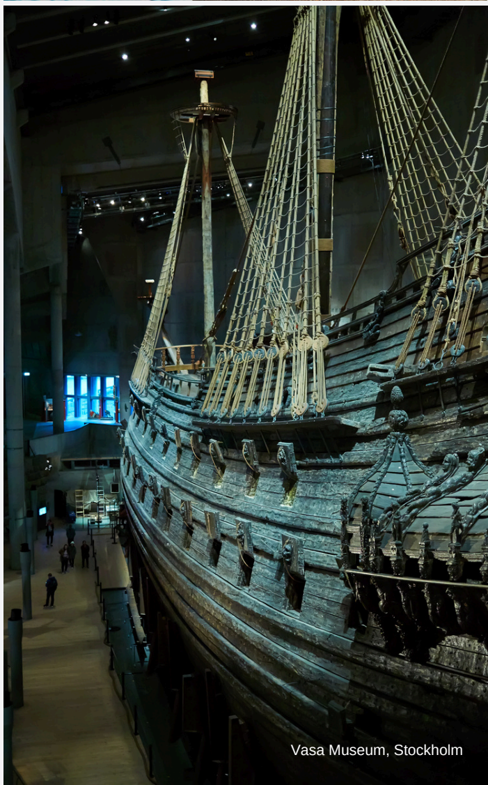
Vasa Museum, Stockholm