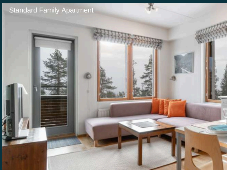
Standard Family Apartment

*Access to the on-site laundromat. Free WiFi*