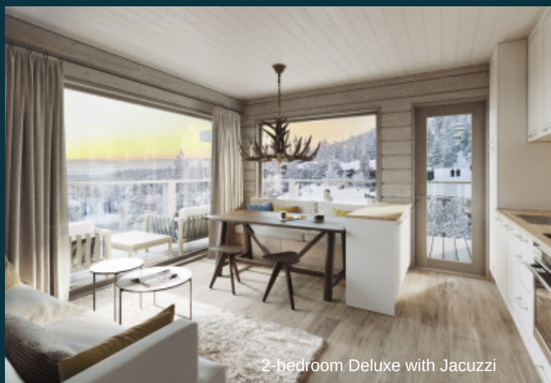
2-bedroom Deluxe with Jacuzzi

Both room types feature private facilities, a drying cupboard, and access to the hotel's sauna and gym. Free WiFi.