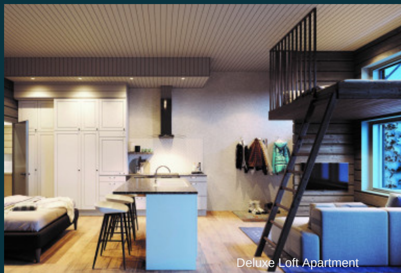
Deluxe Loft Apartment