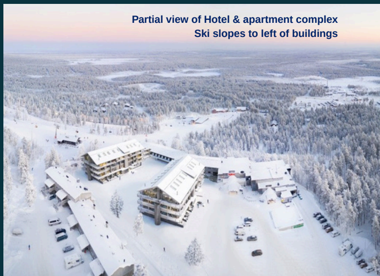
Partial view of Hotel & apartment complex Ski slopes to left of buildings