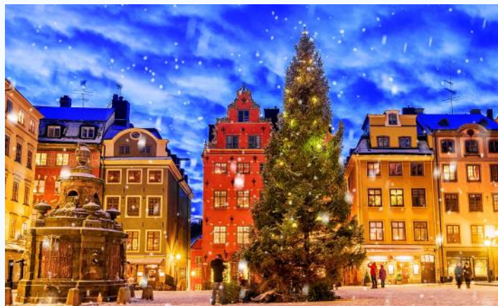
Stockholm at Christmas time

Helsinki is a beautiful city – compact and easy to move around. This morning you have an audio coach tour past the most interesting parts of Helsinki – the historical centre, City Hall, The Parliament buildings, Finlandia Hall and the Opera House. See the Sibelius Monuments and the Temppeliaukio Church (Rock