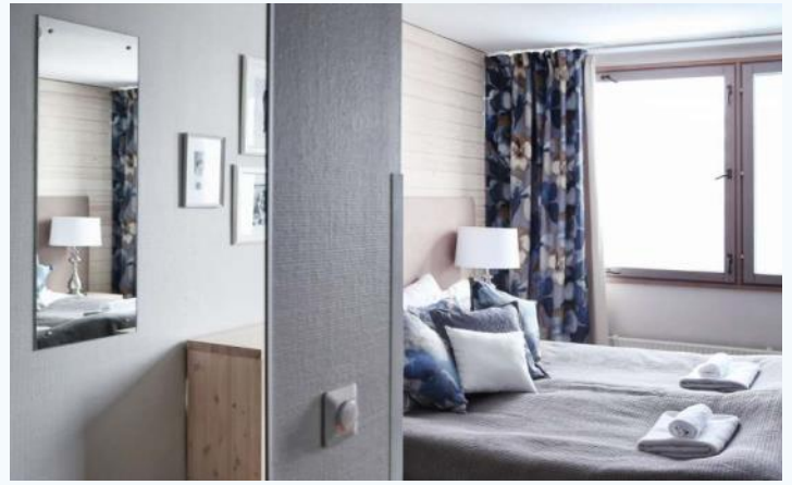
Standard Hotel Room

These luxurious spacious apartments have four bedrooms making them ideal for large families or a group of friends. The heart of the apartment is the high and light-filled dining and living room area. Beside the fireplace, the floor to ceiling windows provide lovely views of the area. Apartments have a fully equipped kitchen, sauna, washing machine and drying cupboard. Firewood and internet are included. Minimum six persons.