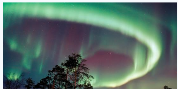
Aurora Borealis / Northern Lights