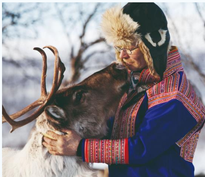
Laplands Favourite Animal