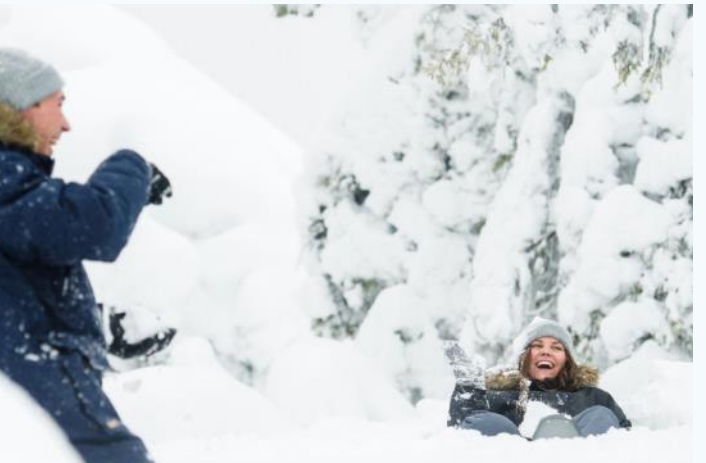
Have a roll in the snow