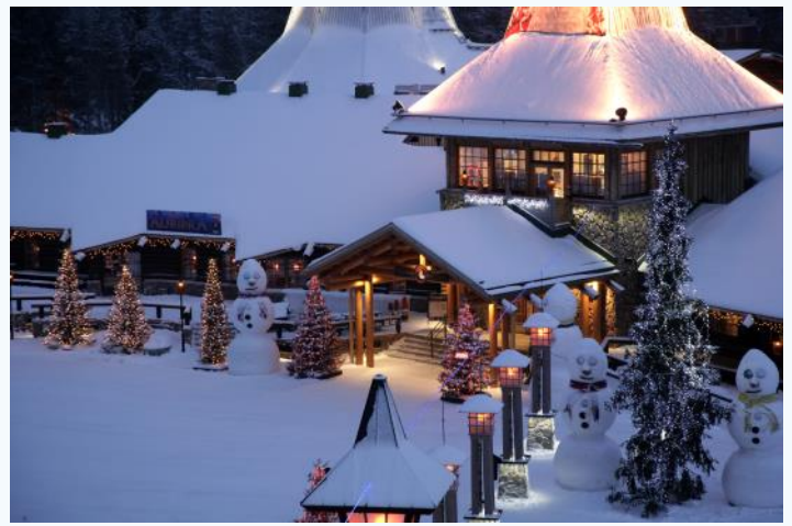
Santa Village Rovaniemi

CALL (07) 5408 4700 EMAIL: info@purescandinavia.com.au