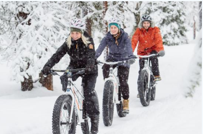
Fatbiking in a winter wonderland